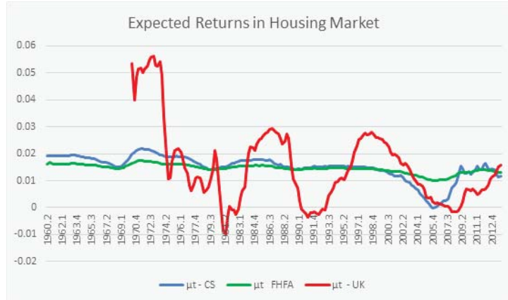
Figure 1: Expected Returns: The graph illustrates the expected returns on houses over time. The red, blue and green line relate to the UK, US-Case-Shiller and US-FHFA.